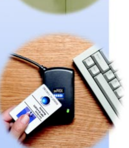
Works with HID's pcProx!